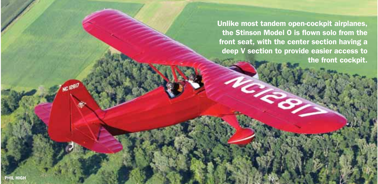
Unlike most tandem open-cockpit airplanes, the Stinson Model O is flown solo from the front seat, with the center section having a deep V section to provide easier access to the front cockpit.